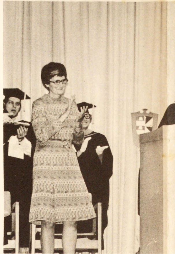
to the Auditorium for the Inauguration ceremonies.