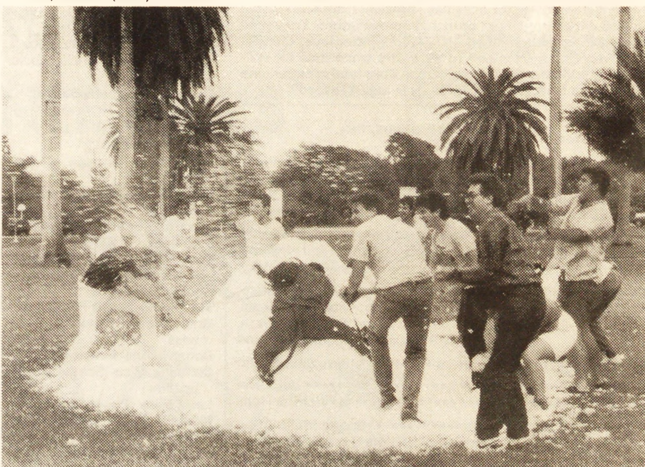
South Florida: Fun, Sun. And Snow??? Barry students recently celebrated an icy affair, when the Barry Student Activities Department coordinated "Carnival Day" in the campus mall area. Students rallied for an old fashioned snowball fight. (small)