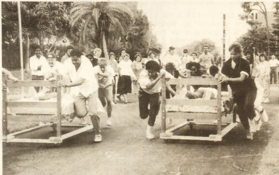
Bed Buds... The "Bed Race" was won by the Barry women's soccer team and Team X. Pictured are the Radicals and the girls from Kelley Hall.