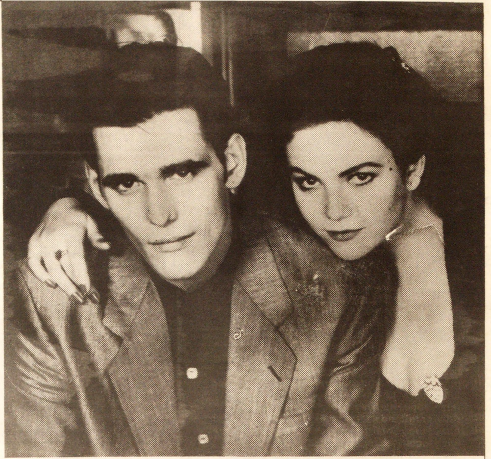
Matt Dillon stars as J.C. "Cully" Cullen, a young man who finds love and a lot more with the sensuous Lorry Dane, portrayed by Diane Lane, after going to Chicago hoping to win fame and fortune in back-room gambling arenas in Columbia Pictures' "The Big Town."

The plot is both bluesy and mood-lifting though it is enlivened by 3 or 4 neatly judged subplots with Bruce Dern, Lee Grant, Tom Skerrit and David Grant. This "The Big Town" should go well with anyone that enjoys the mood of the 50's, notably the fast lane action of the Chicago nightlife.