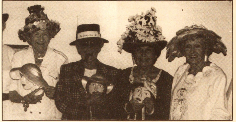
Five members of mascot-selection committee held out for their favorite, The Fightin' Mannequins.

So Bucasne--I mean the Dominican Order of St. Francis of the Holy Ghost Redeeming Gregorian Chanting Conquistadores, not to mention free bible classes, Conquistadores foes, beware of the new Berry mascot and logo because the times they are a'changin.